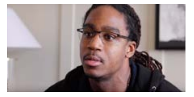
True Administration of Justice USA, Documentary, 9 minutes Directed by Esmé Fox

This film is a poetic monologue about the subtleties of everyday racism.