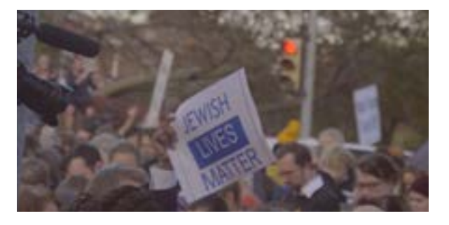
Stronger Than Steel USA, Documentary, 7 minutes Directed by Jacob Pincus

When we are born, we are labeled and separated, but if we walk together, it's easier to choose our own path.