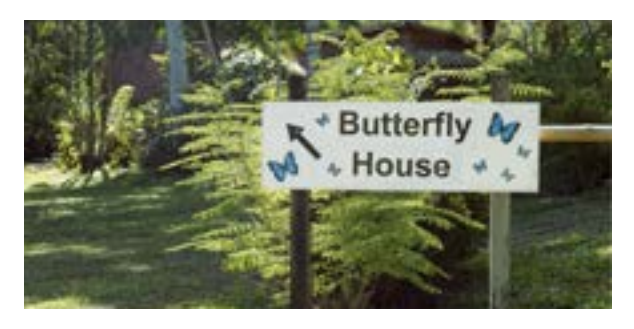
The Butterfly Effect USA, Documentary, 11 minutes Directed by Kate Boylan-Ascione

Surrounded by constant news of violence, catastrophe and crime, a woman watches her neighbors, suspecting they are in some kind of trouble.