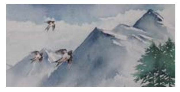
Tank Man USA, Narrative, 15 minutes Directed by Robert Peters

This film explores the U.S. criminal justice system and its inherent racism.